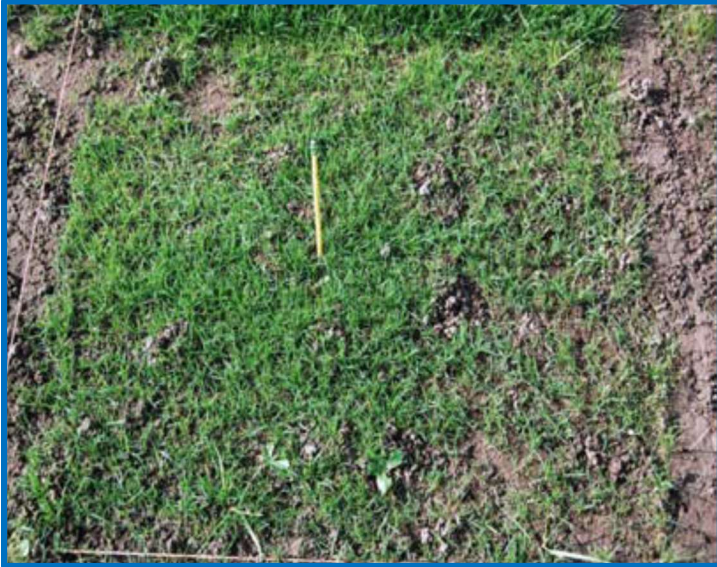
Soil Lynx™ KBG Treated