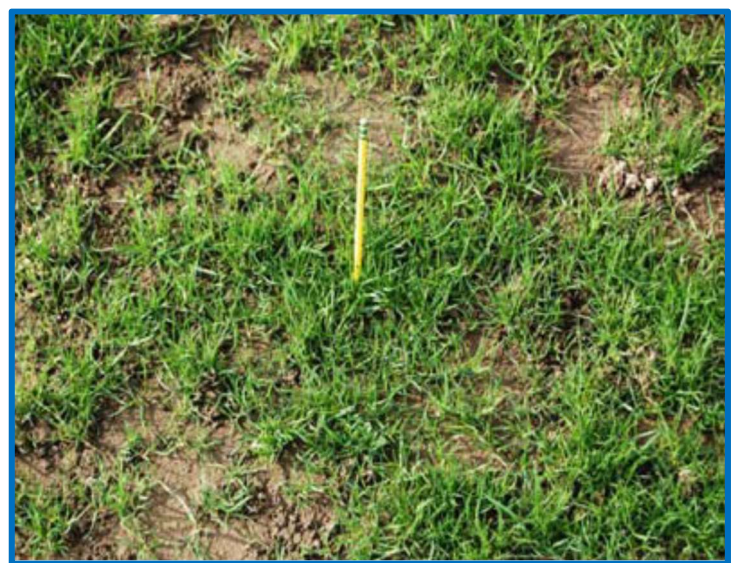
PR Untreated Control