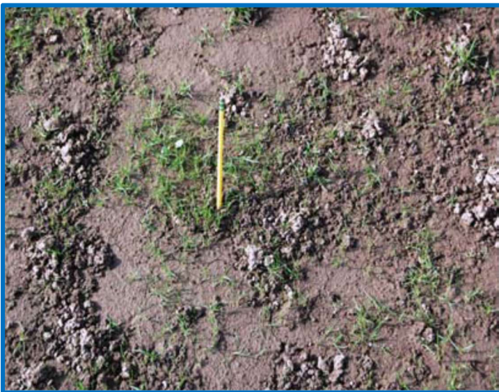
KBG Untreated Control