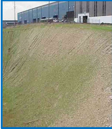
1 WEEK AFTER APPLICATION